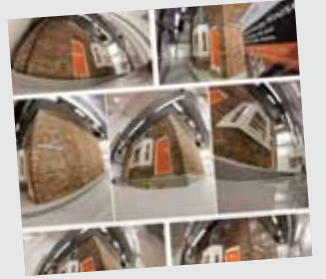
Salford University – Energy House

London School of Fashion's 'Fashion Education in Prisons' project was an excellent example of education reaching out and creating a meaningful and effective partnership. It was achieved in often difficult and trying circumstances and was a win-win activity for all involved. Whilst small scale, the judges felt that the programme was effective in broadening the horizons of staff, students and the often-neglected female prisoners themselves.