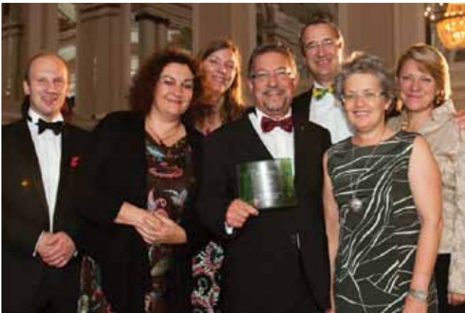
University of Exeter Business School receiving their award for Courses. Go to pages 4 and 5 for the full article.