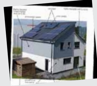
South Lanarkshire College – Low-energy, low-carbon future-proofing of the curriculum

South Lanarkshire College's project set out to design and build an affordable, low-energy, low carbon house on campus in partnership with 50 private-sector companies, whilst also changing their curriculum to embed low-energy and low-carbon approaches in construction as well as incorporating sustainability into all lesson plans.