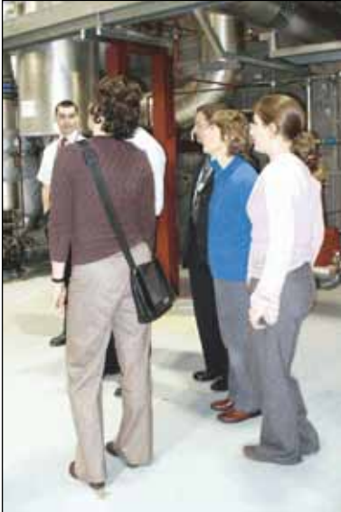
Environmental Champions on a site visit

The University of Aberdeen has launched a new campaign to highlight environmental issues amongst students and staff. The aim of the University's Environment Office is to engage with staff and students, and to raise awareness about the day-to-day issues that impact on our environment. In order to do this the Environment Office wanted to develop a campaign that was appealing to all, different, versatile and that would suit an academic environment.